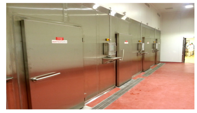
Raw - sausage production