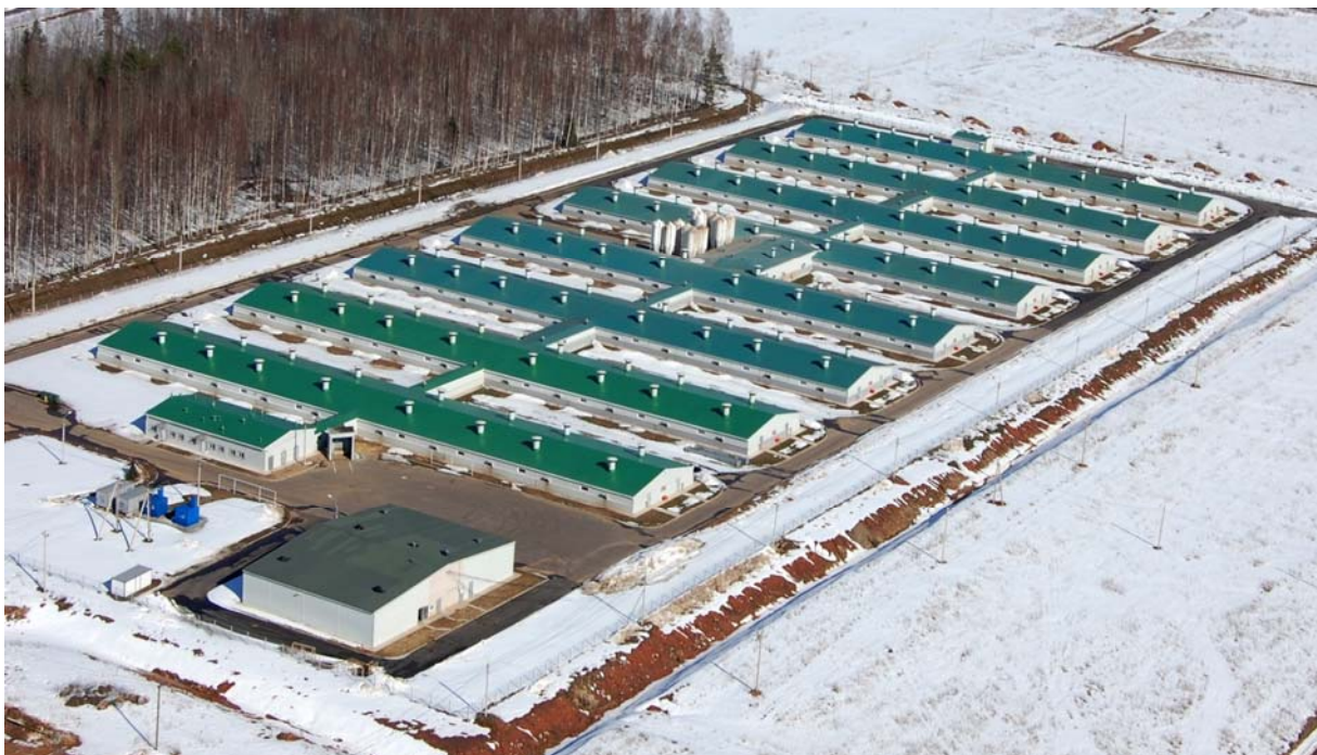
Fattening facility for nearly 20.000 fattening places with central feeding kitchen and liquid feeding for 20.000 pigs

Feeding technology in use: Liquimix liquid feeding