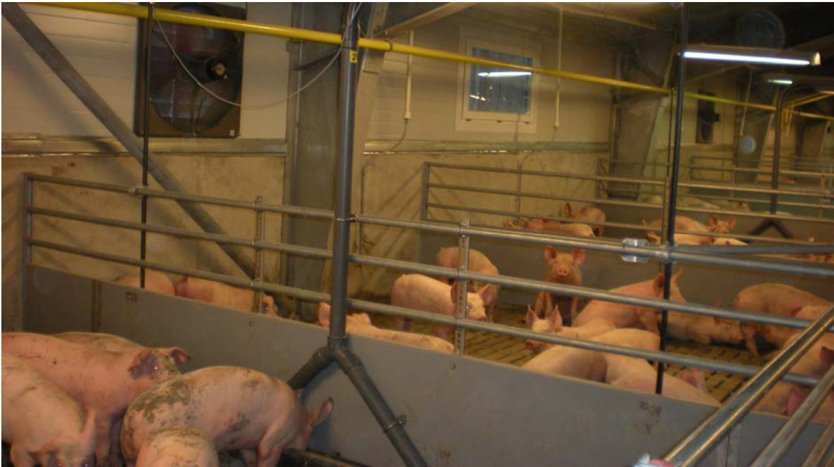
Best care and feed cost savings with Liquimix liquid feeding from Schauer