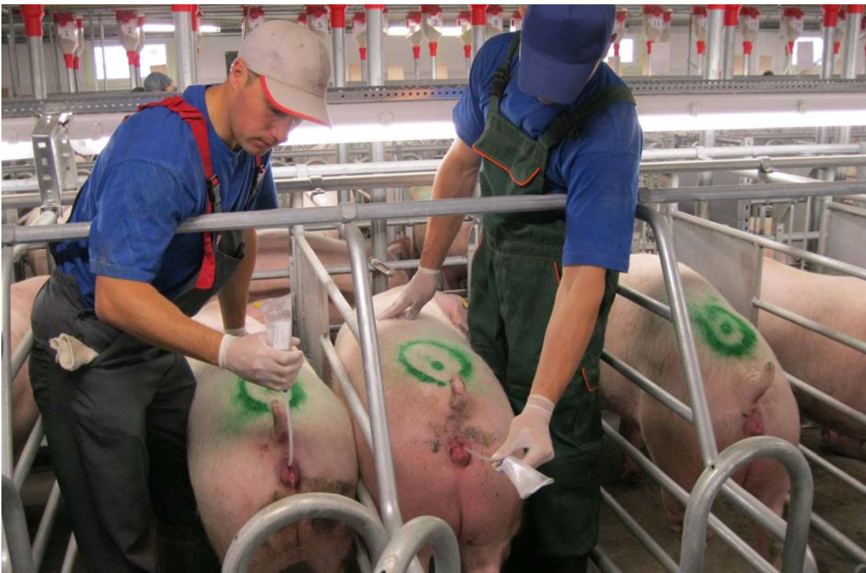
Easy sow insemination procedure due to the convenient for insemination individual stalls even for 2520 sow farm